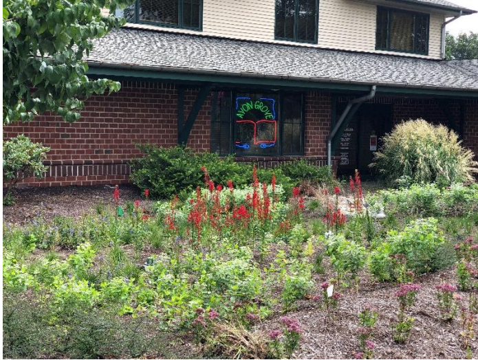
Rain garden at Avon Grove Library

It seems that everything is going “green” these days... and that’s a good thing. You may have heard of things like rain gardens, permeable pavement and bioswales described as Green Stormwater Infrastructure (GSI) . These new practices attempt to mimic the natural water cycle by promoting infiltration at the source of stormwater run-off, slowing it down and recharging our natural ground water systems.