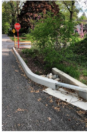
Permeable pavers, West Chester, Bioswale, Lancaster, PA, Stormwater Bumpout, West Chester

By mimicking the natural water cycle, green stormwater infrastructure aims to treat stormwater at its source and then slowly and naturally absorb it into the soil or native vegetation and filter it into the groundwater. A Guide to Green Stormwater Infrastructure is available at https://cwmp.org/homeowner_resources/ , and describes sixteen of these practices; their benefits, applications, costs, operation and maintenance with photos of local examples. These GSI practices include: